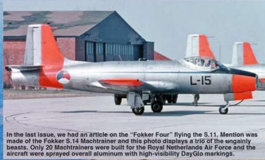
In the last issue, we had an article on the "Fokker Four" flying the S.11. Mention was made of the Fokker S.14 Machtrainer and this photo displays a trio of the ungainly beasts. Only 20 Machtrainers were built for the Royal Netherlands Air Force and the aircraft were sprayed overall aluminum with high-visibility DayGlo markings.