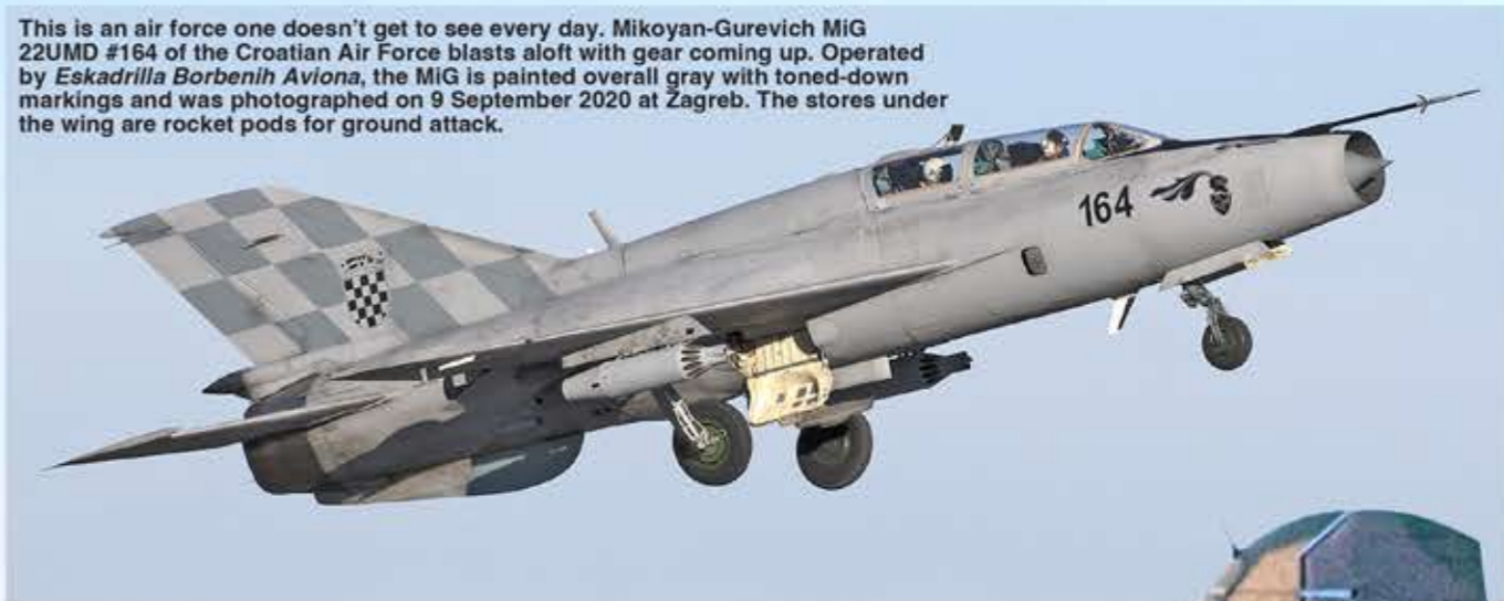
This is an air force one doesn't get to see every day. Mikoyan-Gurevich MiG 22UMD #164 of the Croatian Air Force blasts aloft with gear coming up. Operated by Eskadrilla Borbenih Aviona , the MiG is painted overall gray with toned-down markings and was photographed on 9 September 2020 at Zagreb. The stores under the wing are rocket pods for ground attack.