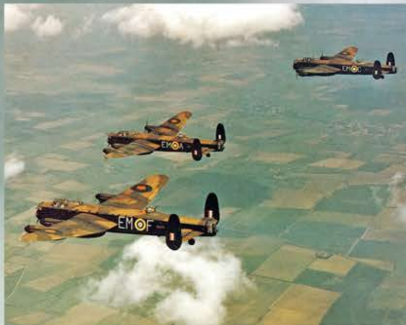
Avro Lancaster B Mk. Is of No. 207 Squadron in formation. Lancaster W4191/EM*Q based at RAF Langar was piloted by Sgt. J.R. Walker on 21 December 1942 when it was intercepted by a Luftwaffe Bf 110F-4 over Holland following a raid on Munich. The German night-fighter was piloted by Oberleutnant Reinhold Knacke of 1./NJG 1 and he sent a steady stream of fire into the Royal Air Force bomber. The fuel tanks ignited and the bomber plunged to earth with the entire crew of seven being killed.

A FURTHER SELECTION OF RARE COLOR AIRCRAFT IMAGES FROM THE CHALLENGE ARCHIVES BY MICHAEL O'LEARY