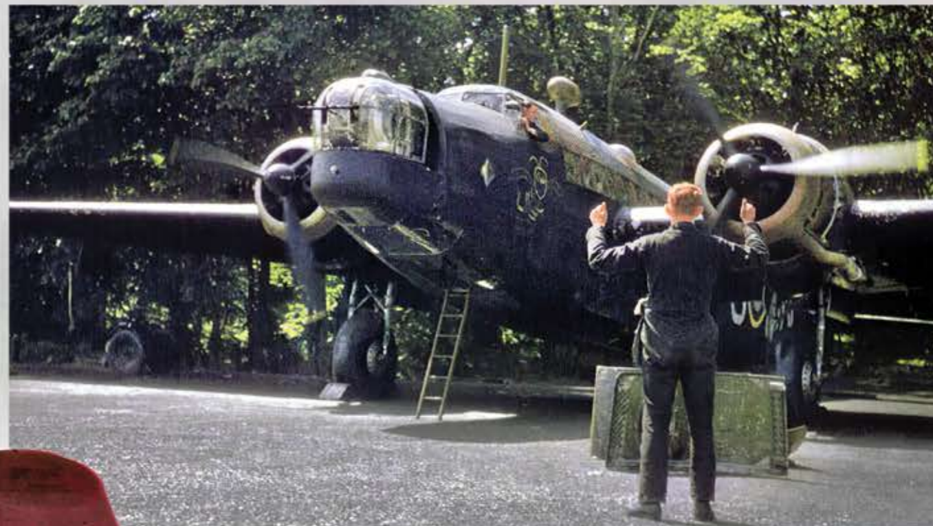
Vickers Wellington B Mk. IC R1593 coded OJ*N of No. 149 "East India" Squadron has its Bristol Pegasus radials run up at RAF Mildenhall's Mons Woods. It quickly became too dangerous to operate the Wellington during the day over Occupied Europe and most operations were carried out at night as one of the principal bombers of Bomber Command. During 1943 it began to be superseded by four-engine heavy bombers but continued to serve through the war. It was the only British bomber produced for the duration of the war and was constructed in a greater quantity than any other British-built bomber. This view shows the flat black bottom surfaces of the Wellington to advantage.